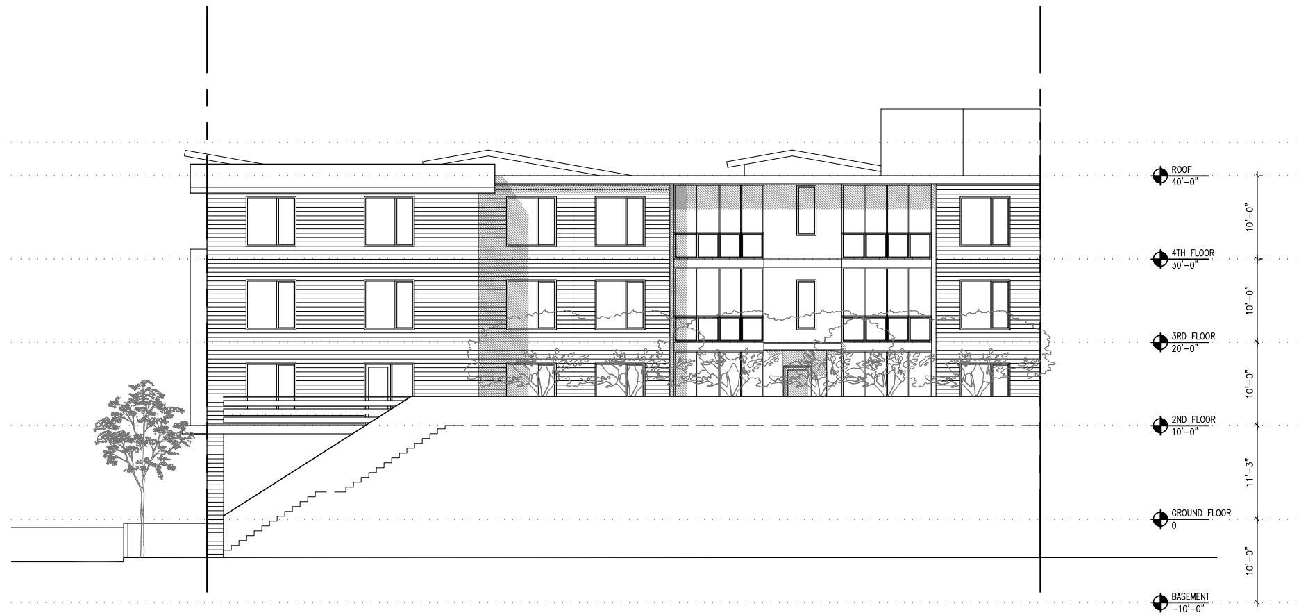
1 SOUTH ELEVATION 40' 1/16"=1'-0"